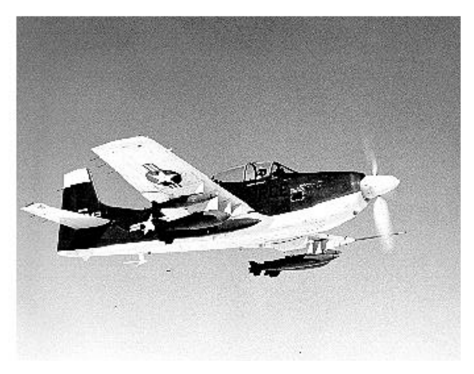
Farm Gate Aircraft—T-28