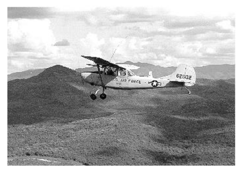
O-1 "Bird Dog"

for many years with no end in sight. The average Vietnamese pilot saw the law of averages working against him and was reluctant to fly below two thousand feet. If he mistakenly directed an attack on friendly people, criminal prosecution awaited him. The prevailing American view saw Vietnamese crews as unaggressive and unreliable. By October, this disapproval was being expressed by the overwhelming sentiment that "Americans must run things." 54