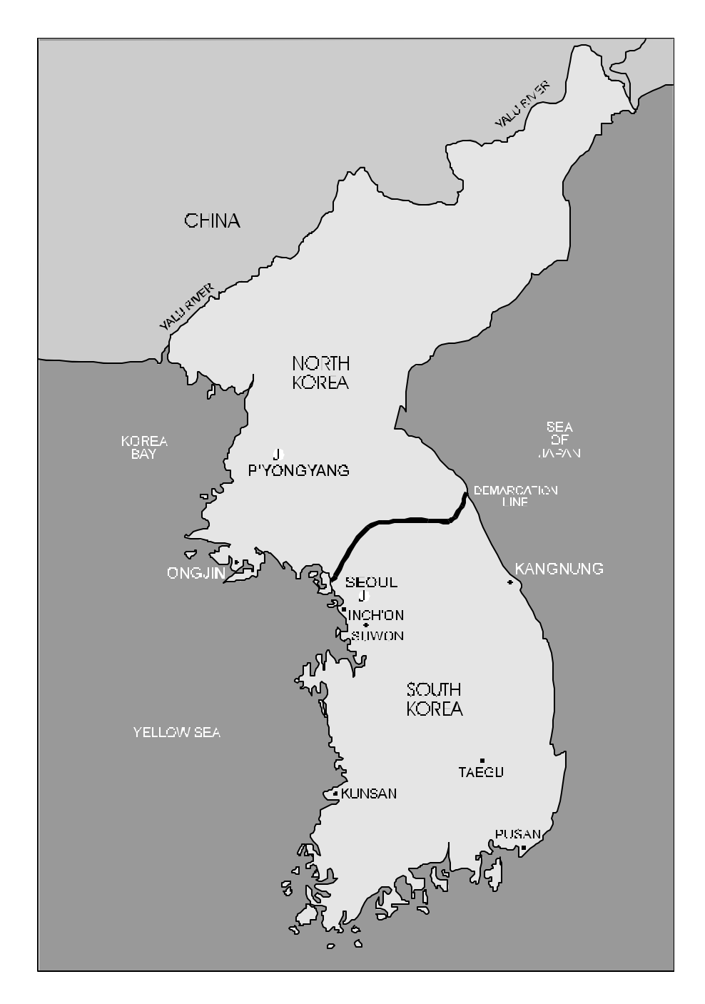
Figure 1. Korean Peninsula