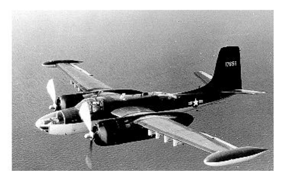
Farm Gate Aircraft—B-26