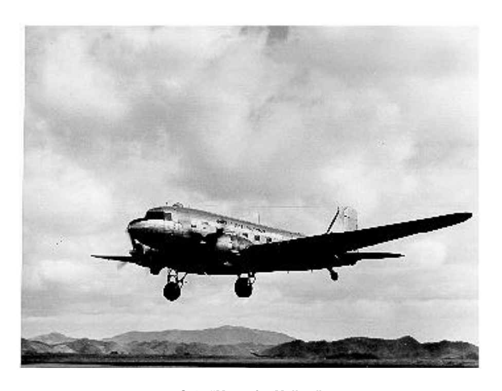
C-47 "Mosquito Mellow"

General Partridge placed "considerable stress" on attaching experienced Air Force officers to liaison duty with Eighth Army