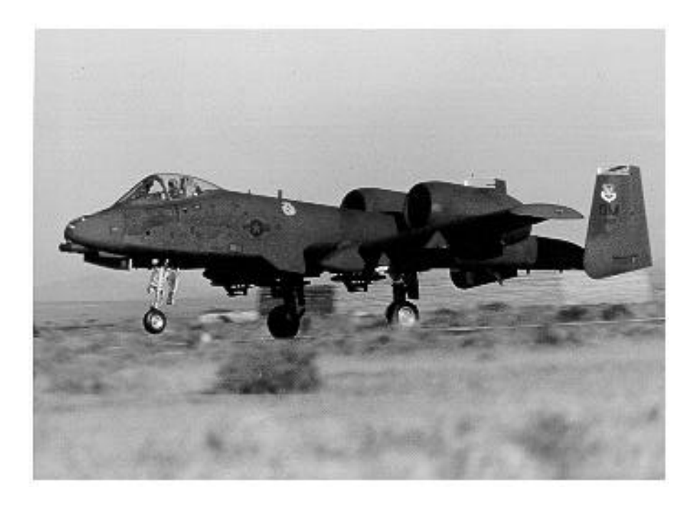
A-10 "Thunderbolt II"

provide much of the FAC support. Armed with a 30 mm "Avenger" seven-barrel cannon, the A-10 can also carry a variety of munitions to support close air support. Funding was terminated in 1983; the last of 713 A-10s was delivered in March 1984.<sup>6</sup>