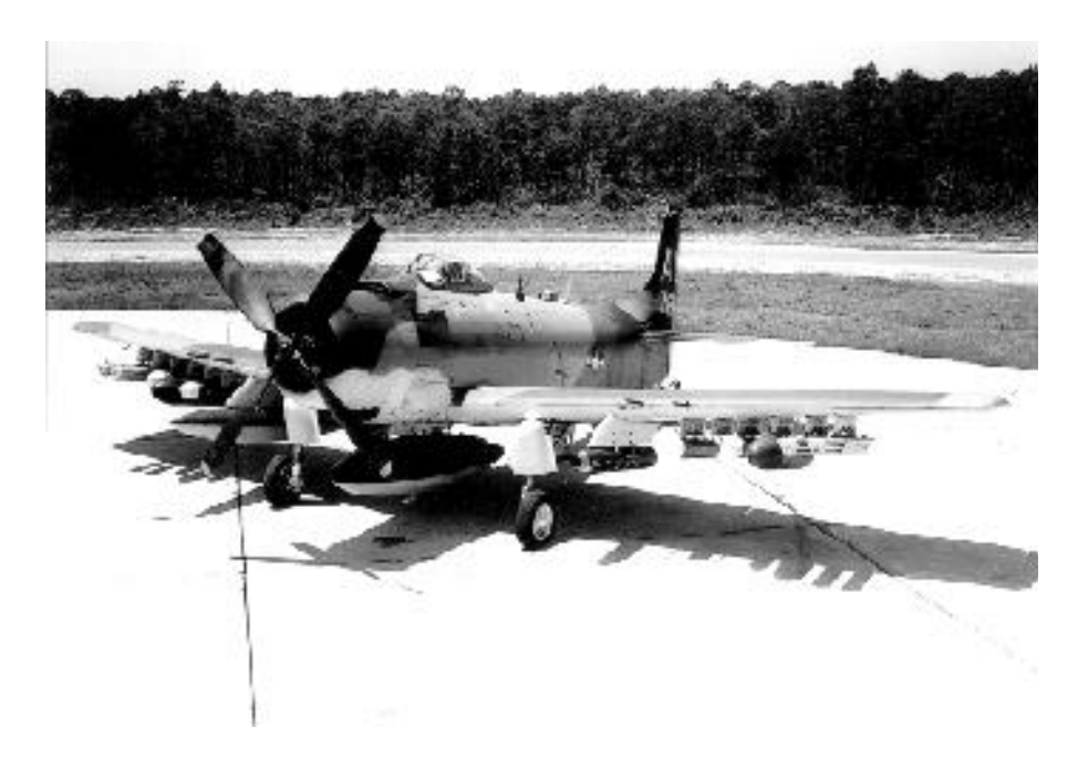
Farm Gate Aircraft—A-19